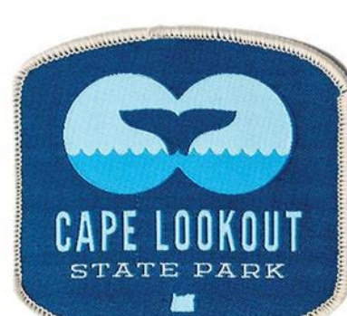
Oregon Coast State Parks